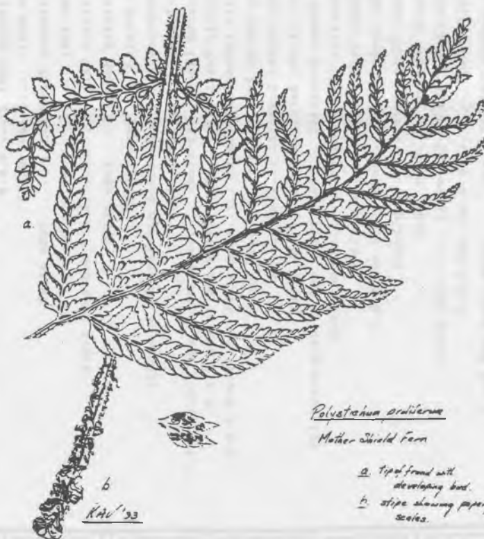
Polystichum proliferum Mother Shield Fern