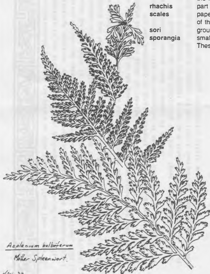
Asplenium bulbiferum Mother Spleenwort.