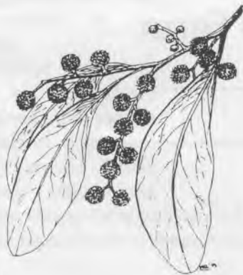
The Golden Wattle ( Acacia pycnantha )

After eight weeks of sunshine and warmth in Darwin, Alice Springs and places en route, I am still trying to catch up with more local Park matters.