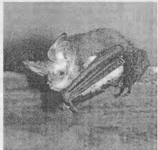
Lesser long eared bat (Cath Andrew)

"One of a colony of Lesser Long Eared Bats that frequent our garage. Sometimes they clump in groups of 10 or more."