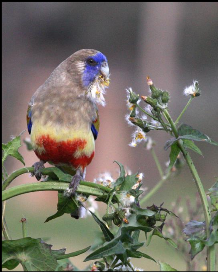
It's hard to hate weeds when they bring such beautiful parrots such as this Blue Bonnet seen at Kidman's Camp Bourke, NSW in late June.