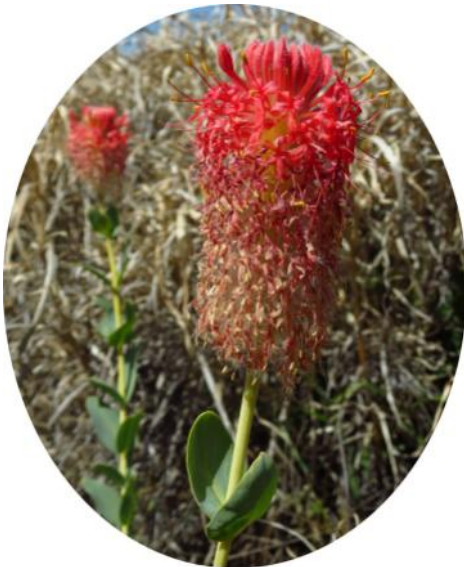
Flinders Poppy ( Pimelea decora ).

REGISTRATION BY AUSTRALIA POST PP 346802 / 0005 If undeliverable please return to Friends of Warrandyte State Park Inc. P.O. Box 220 Warrandyte, 3113