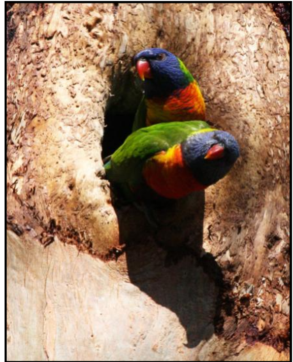
Rainbow Lorikeets (above) were staking claims on nesting hollows in Glynns Reserve beside the Yarra in late August 2012

Cockies made a big fuss about this hollow nearby.