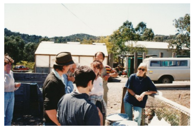
A range of activities & re-vegetation work was undertaken.

The nursery expanded and became a focal activity.