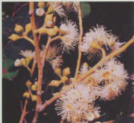
Swamp Gum Eucalyptus ovata

Warrandyte eucalypts have cream or white flowers. Flowering time is variable throughout the year depending on the species. Close examination of the buds and fruits (gumnuts) makes identification easier. Their position in the landscape can also give a clue to which species is which. Use this list as a rough guide and remember there will be exceptions.