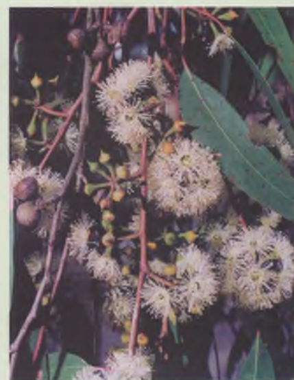
Red Stringybark Eucalyptus macrorhyncha

Tall tree to 50m. Jan-May Leaves long and narrow. Juvenile leaves sword shaped, opposite, stalkless. Bark rough at base, otherwise white, smooth, shed in strips.