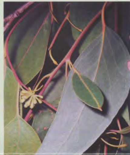
Messmate Eucalyptus obliqua