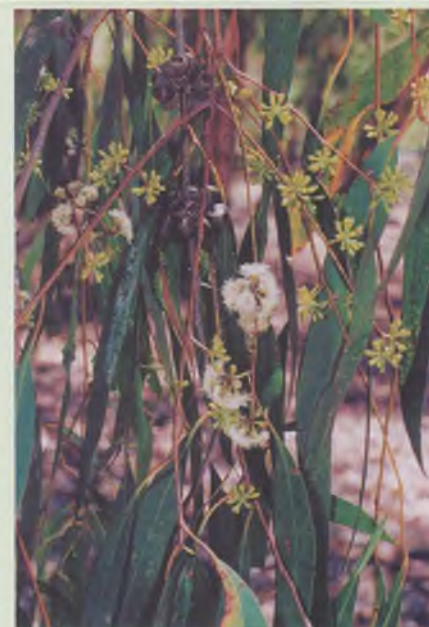
Narrow-leaf Peppermint Eucalyptus radiata

Small to medium tree to 20m. Oct-Jan Small, thin, narrow, bright green leaves, strongly aromatic. Juvenile leaves opposite, narrow, stalkless on rough stems. Very fine scaly bark.