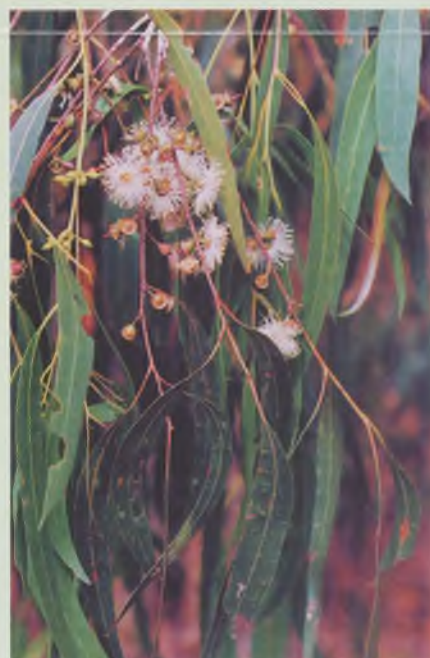
Manna Gum Eucalyptus viminalis