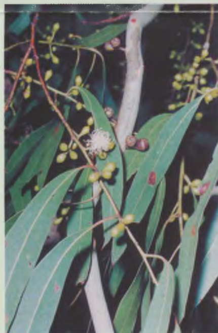
Candlebark Eucalyptus rubida