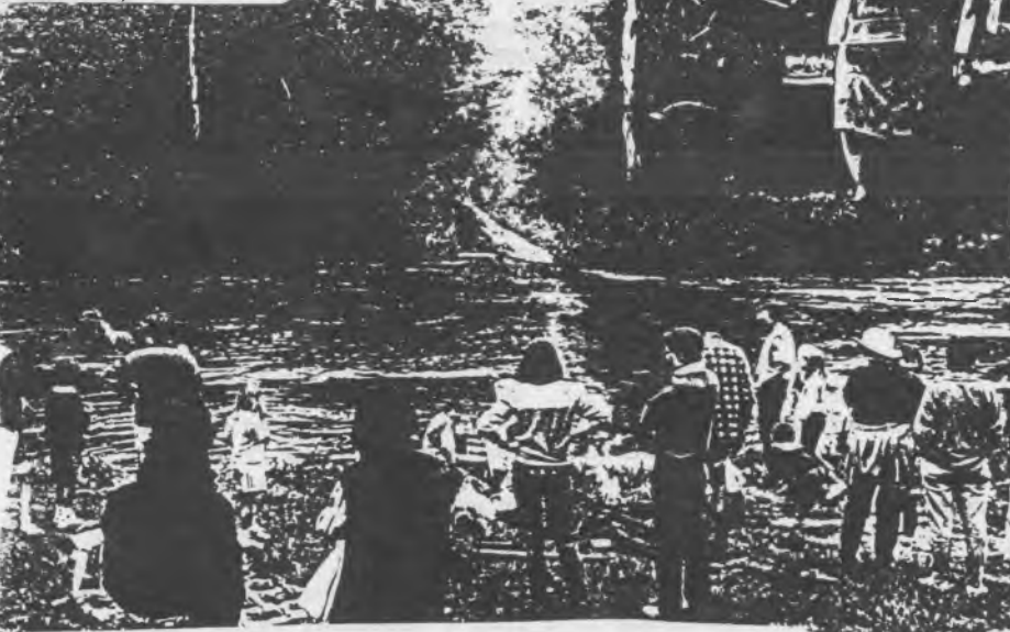
Many Friends joined the W.E.L. walk. We plan many "joint ventures" for 1990.