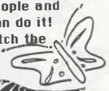
Eltham Copper Butterfly