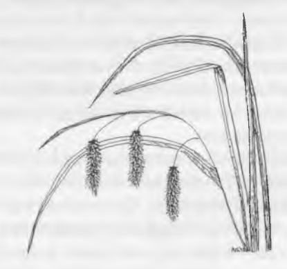
Tassel Sedge – one of the rare and threatened species being grown at the nursery for enrichment planting.

For Fowspians, year 2001 is shaping up as 'nursery odyssey' – an extended process of development and change, an adventurous journey.