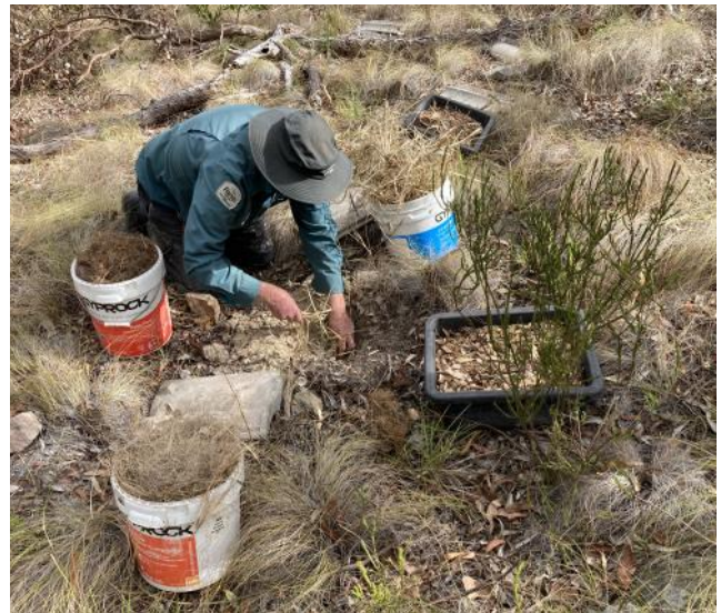
Above: Cam showing how it's done