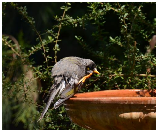
Above: in my garden — Musk Lorikeet ( Glossopsitta concinna ), Rainbow Lorikeet ( Trichoglossus moluccanus ) and, naturally, a Noisy Miner ( Manorina melanocephala )