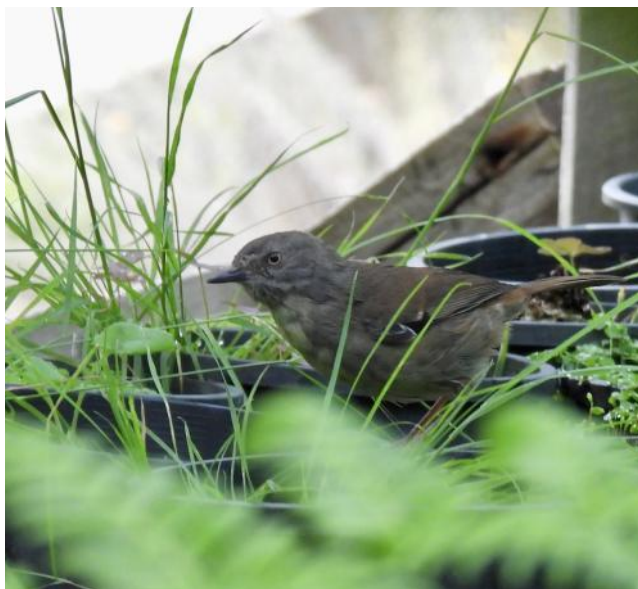
Above: Spotted Pardalote ( Pardalotus punctatus ) and White-browed Scrubwren ( Sericornis frontalis )