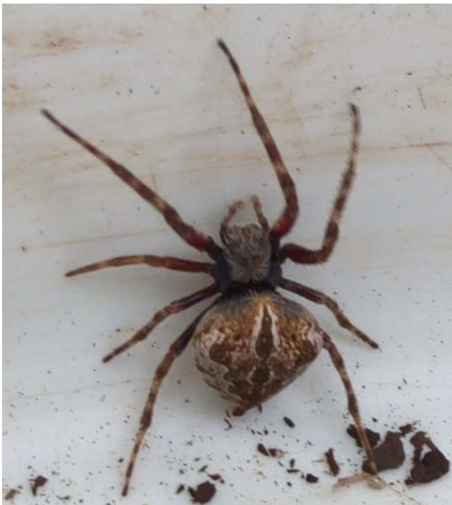
Above: an orb-weaver spider, probably the Garden Orb-weaver ( Eriophora transmarina ), found with seeds collected at the nursery