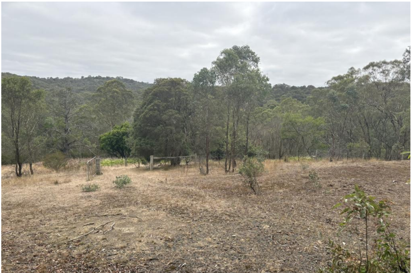
Two views of the enclosure at Nilja. Top shows the agapanthus infestation that is the major concern and below is a general view of the site