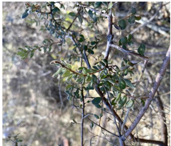
Above: Hakea ulicifolia