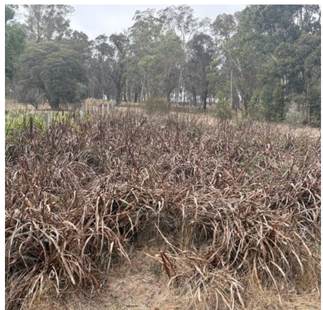
Above: Watsonia bulbifera in its dormant state — it greens up later in the year